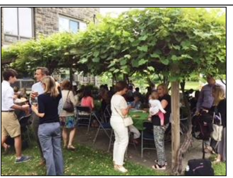
Sunday, June 10—A perfect day for the RPC Annual Picnic.