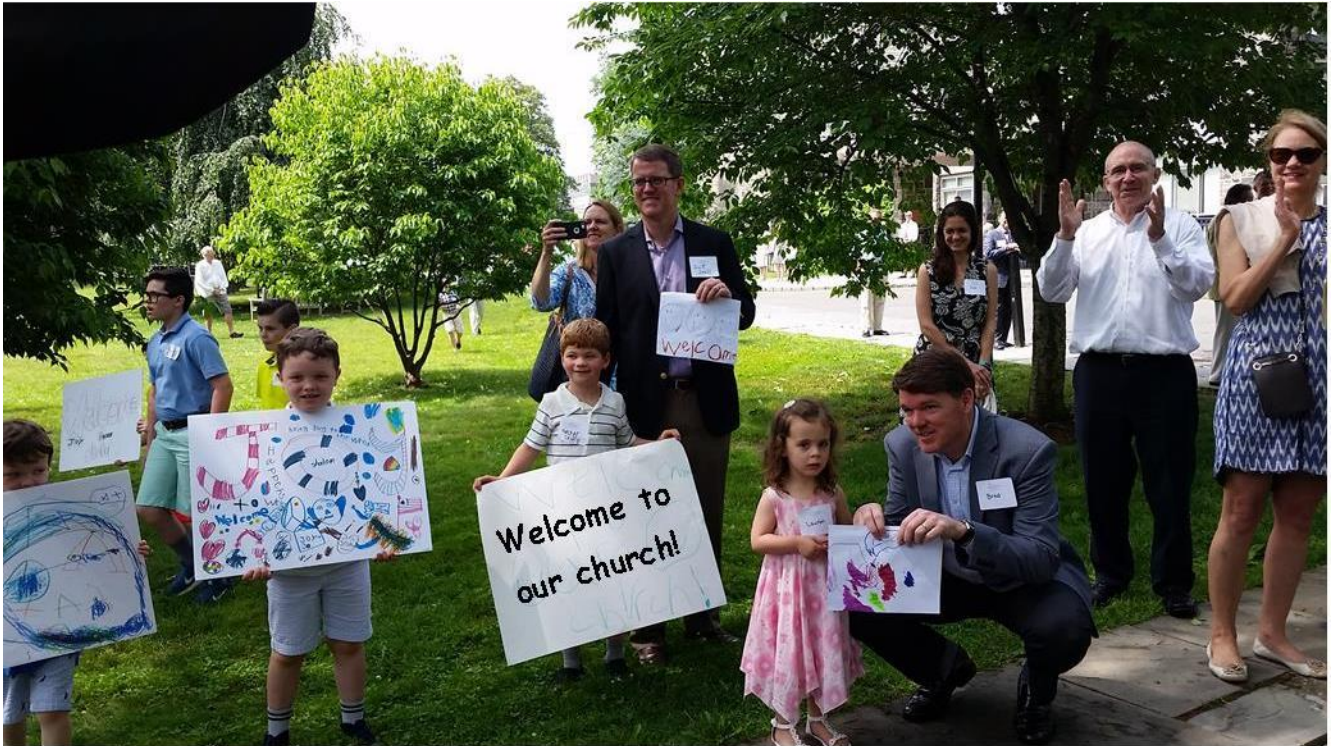
RPC welcomes Community Synagogue – June 2017

Rye Presbyterian Church 882 Boston Post Road Rye, New York, 10580