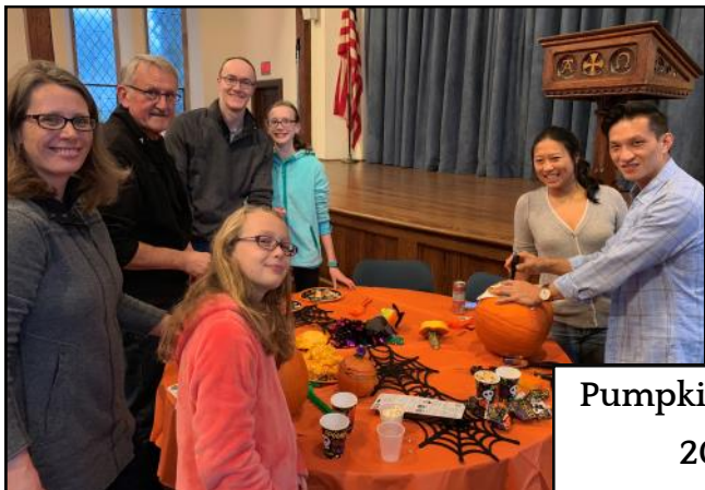
Pumpkin Carving 2018!