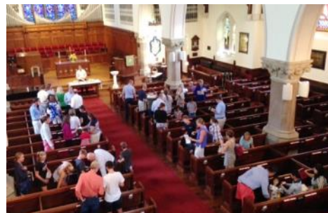
Our First Saturday at 5 Service began on Sept. 17!

Thank you for your continued generosity toward fulfilling all God imagines!