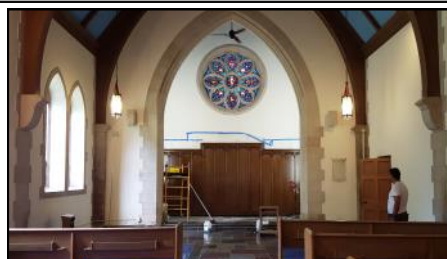
Work on Chapel beginning—at right, steel posts for old altar rail