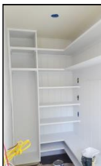
Progress on the 900 Manse kitchen