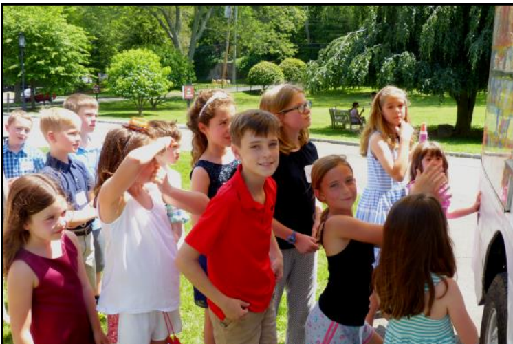
The ice cream truck was a popular place to be!