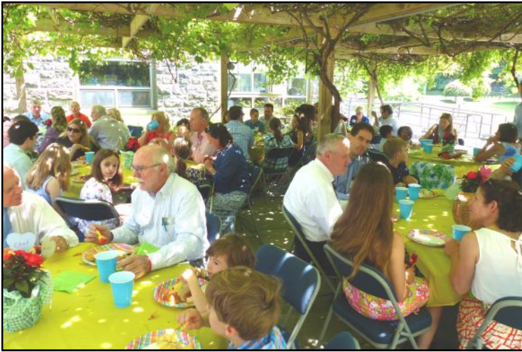
Sunday, June 11, was a perfect day for the RPC Annual Picnic.